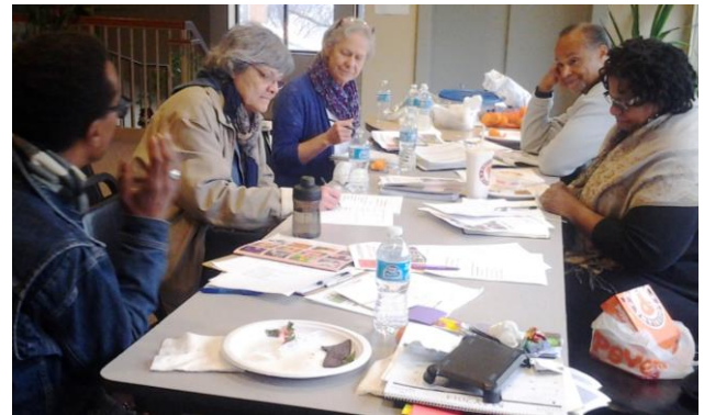
URBAN FARM AND GARDEN ALLIANCE MEETING