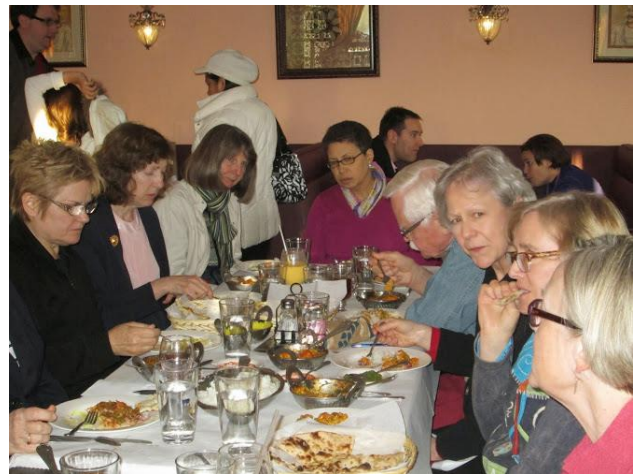
DIVERSITY COMMITTEE MEETING