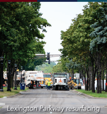
Lexington Parkway resurfacing