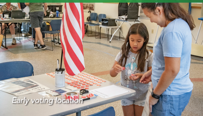
Early voting location

Get the full picture at ramseycounty.us/PAFR