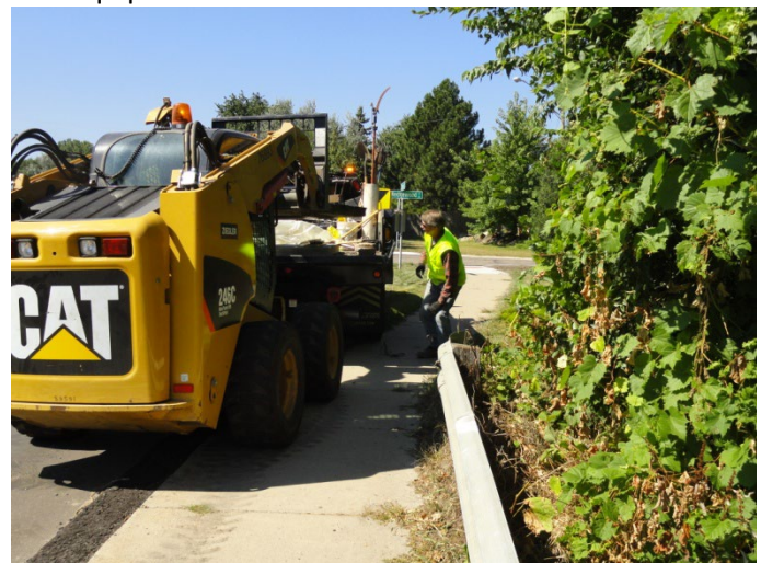
Loading/unloading, steering climbing with heavy equipment.