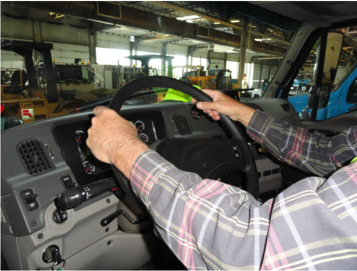
Driving – frequent/constant levels (3-8 hours/day).