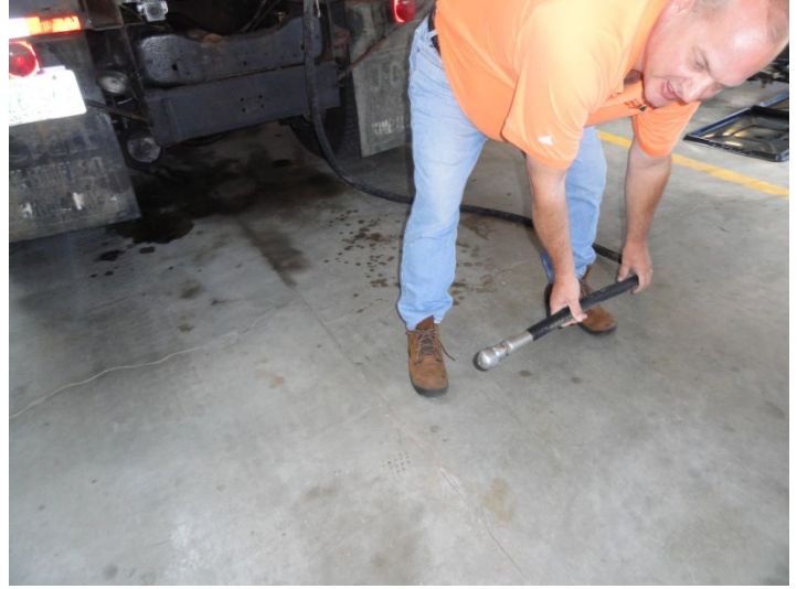
Example of trenching forward bent, twist, grip and push/pull to insert/remove equipment.