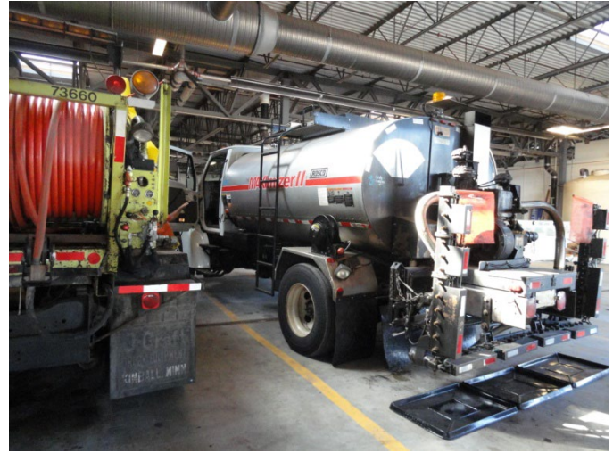
Oil distributor truck. Note vertical ladder climb.