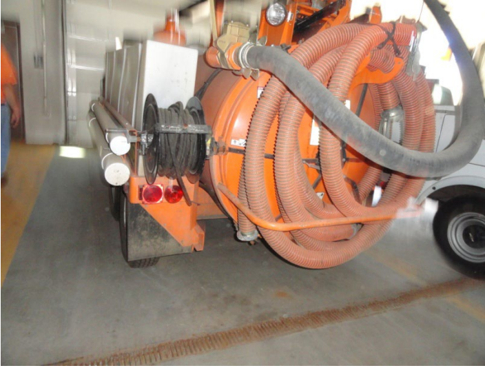
Hoses for vacuum excavator machine (used with gas/utility).