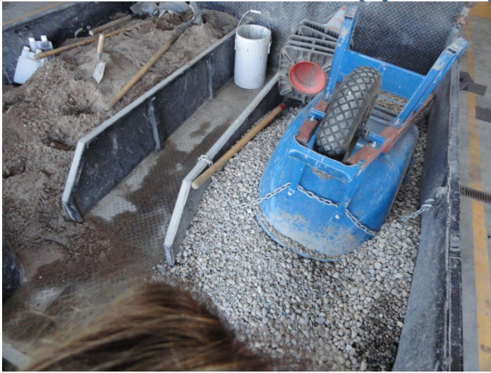
Tools: Shovels, wheel barrels, buckets for gravel, rock or dirt.