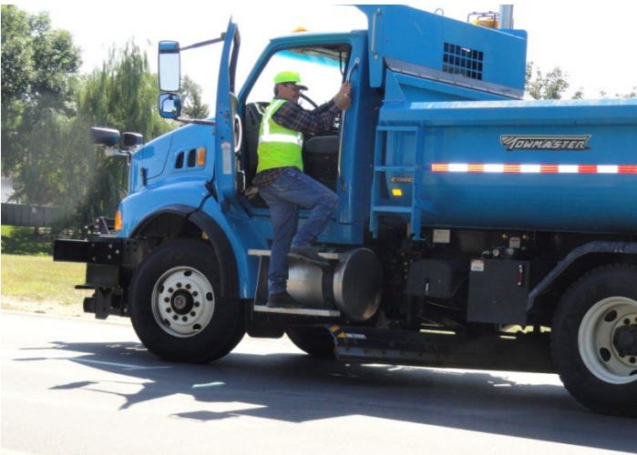
Climbing in/out of truck or heavy equipment/truck to drive.