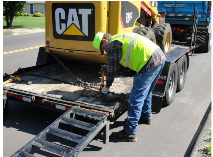
Ratcheting tie downs (grip/bend) to transport heavy equipment.