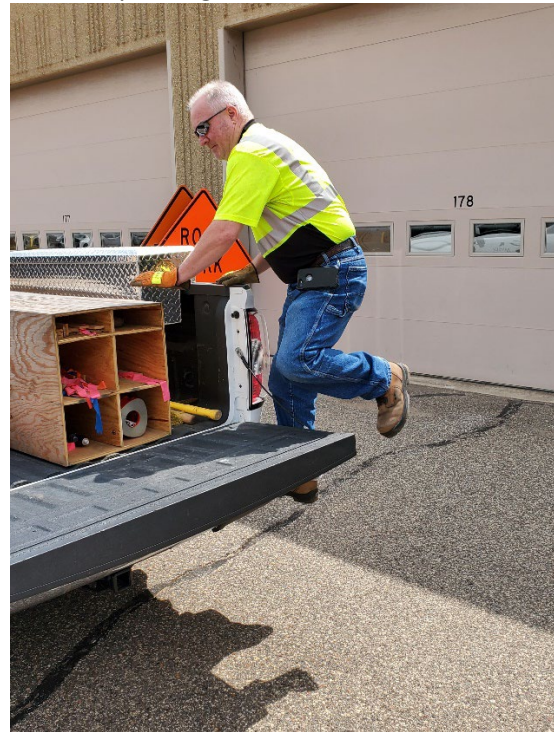
Climb onto or off equipment for supplies, tools, etc. Steps from 11"-24" off ground.