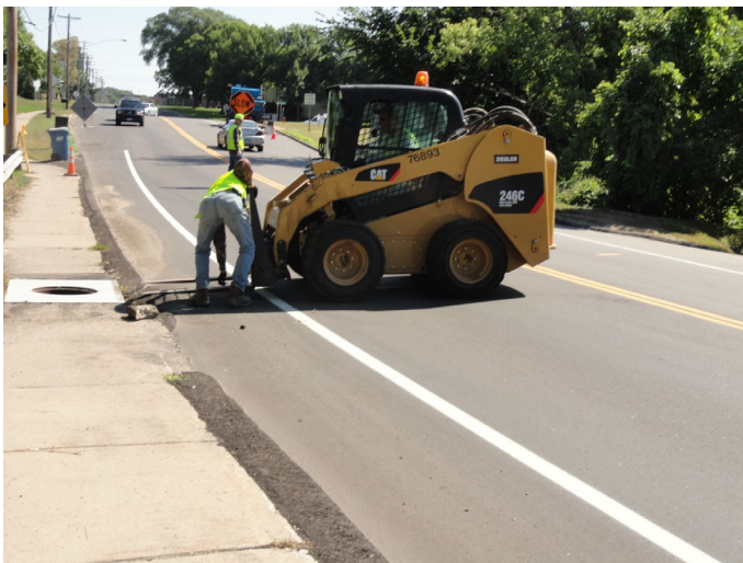
Bobcat operation and direction of crew lead at jobsite.