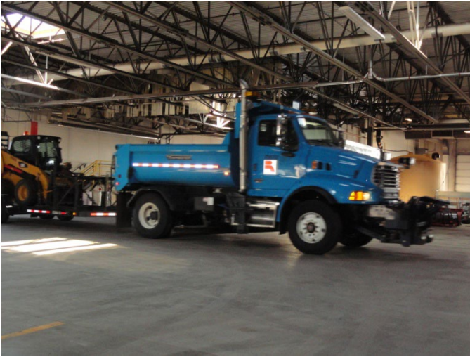
Dump truck has plow attachment for winter.

VARIOUS EQUIPMENT DRIVEN, MOVED, IN AND OUT OF, LOADED, UNLOADED FOR JOB.