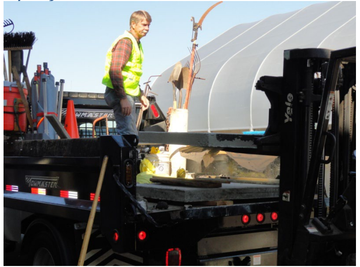
Example of climbing on and in truck to locate supplies or tools needed for the job.