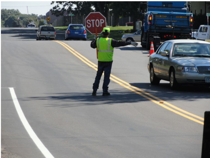
Occasional/frequent standing on even/uneven surfaces.