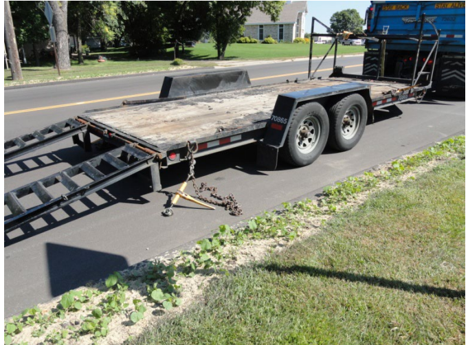
Trailer (flat bed). Loading equipment on and off.