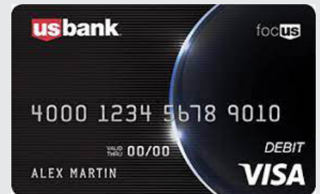
Example of a US Bank Focus Card, delivered in a generic white envelope