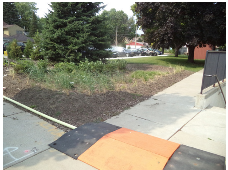
Raingarden capturing runoff from large roof area.

Funding for this project was provided by the Ramsey Conservation District (RCD) by a grant offered by MN Board of Water and Soil Resources (BWSR) through funding provided by the Clean Water Fund, Capitol Region Watershed District (CRWD), and the property owner.