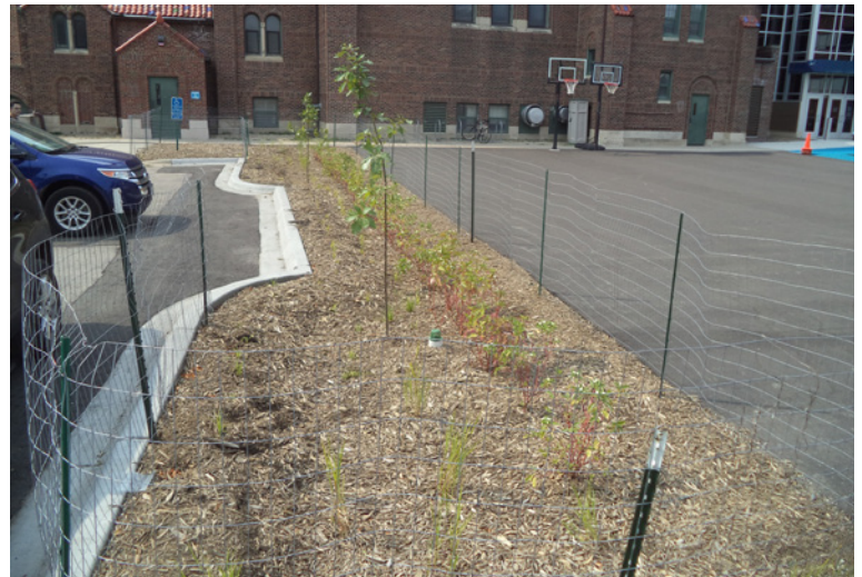
Raingarden capturing runoff from playground.