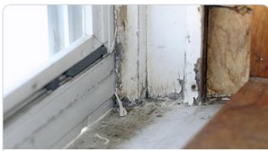
Lead at Home