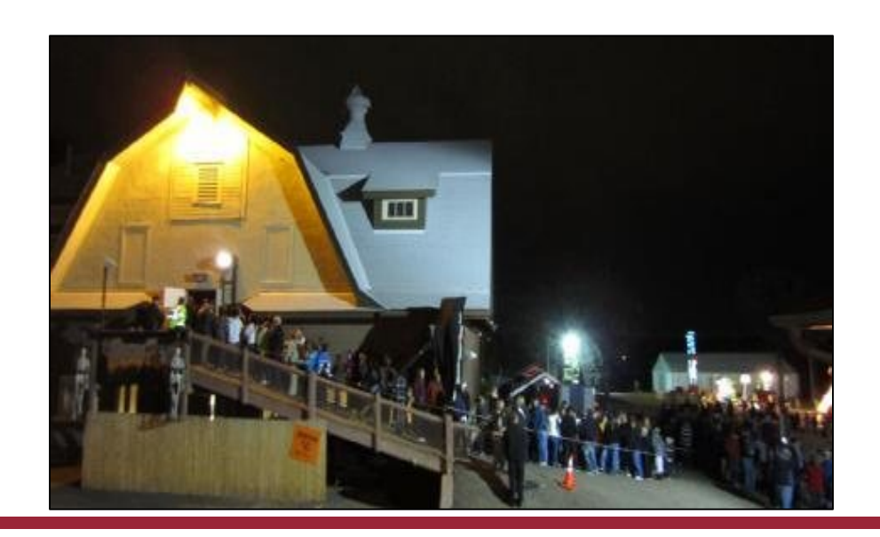
Fright Farm - October