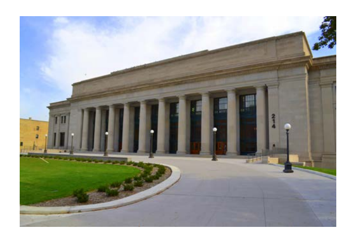
All are on the National Register of Historic Places.