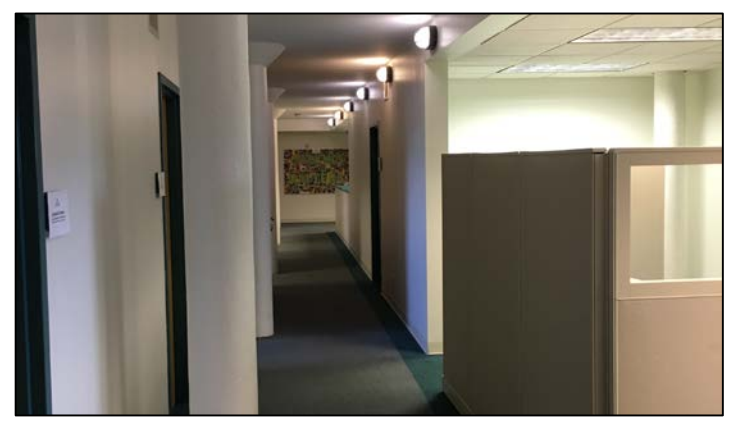
Extension Services office