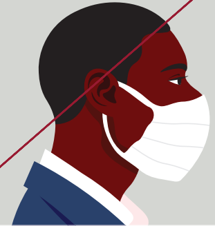
"THE LOOSEY GOOSEY"

DON'T: Wear your mask loosely with gaps on the sides