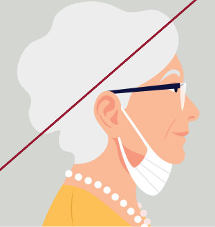
"THE NECK WARMER"

DON'T: Push your mask under your chin so it rests on your neck