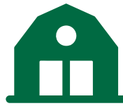
Food for animals