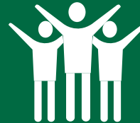
Positive customer relations