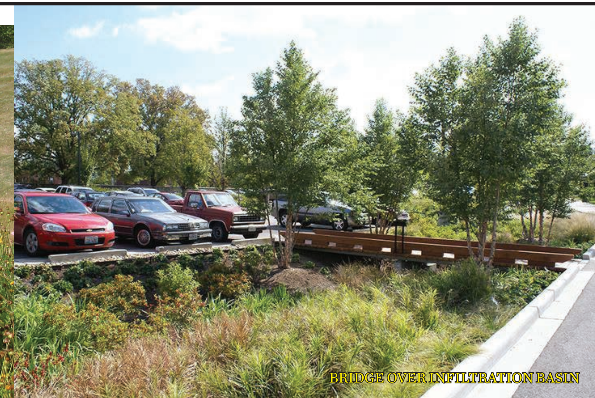
BRIDGE OVER INFILTRATION BASIN