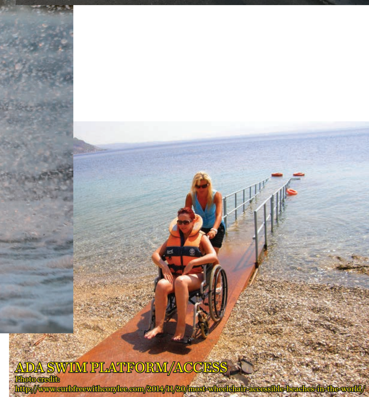
ADA SWIM PLATFORM ACCESS