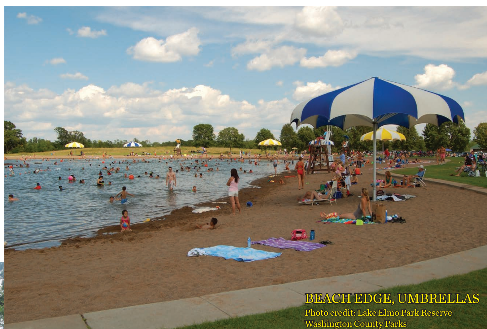
BEACH EDGE, UMBRELLAS