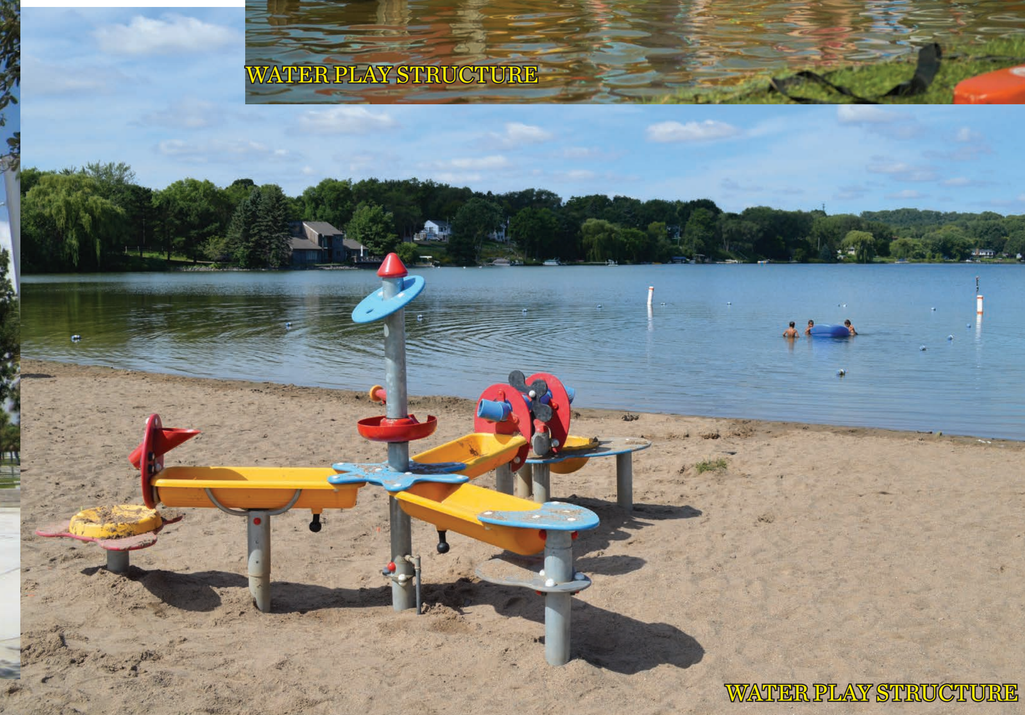
WATER PLAY STRUCTURE