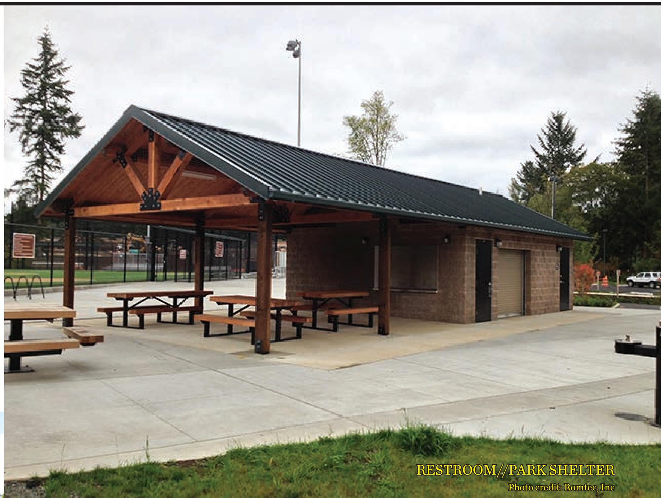
RESTROOM / PARK SHELTER