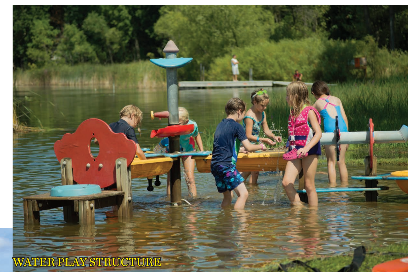
WATER PLAY STRUCTURE