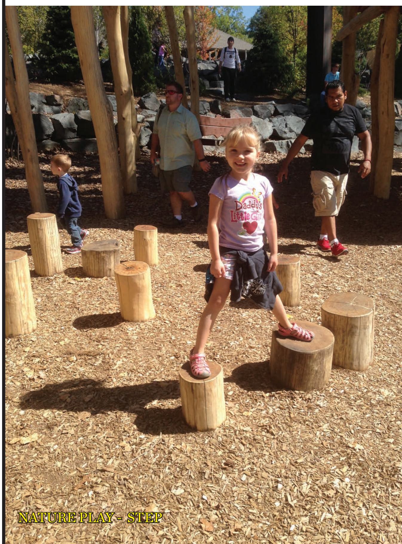
NATURE PLAY - STUMP