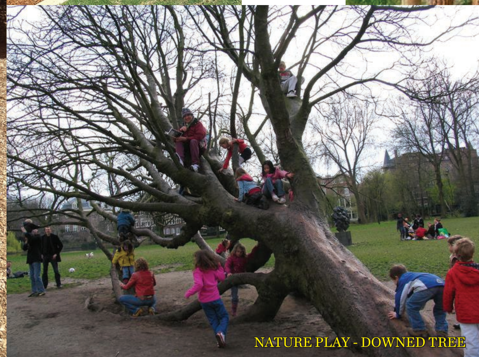
NATURE PLAY - DOWNED TREE