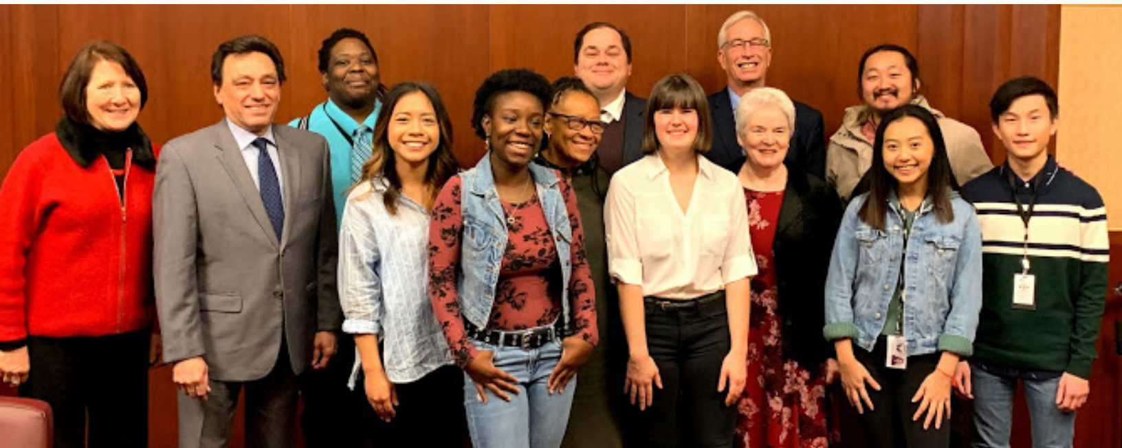
Ramsey County commissioner's, staff and youth from Kitty Andersen Youth Science Center and Move MN.

The Board of Commissioners had the opportunity to hear directly from the engagement partners and youth on their findings during two workshops. Many of the recommendations highlighted topics that Ramsey County plans to improve, but have not operationalized yet. Staff have incorporated feedback from the community partners and public comment period into the final version of Ramsey County 2040 .