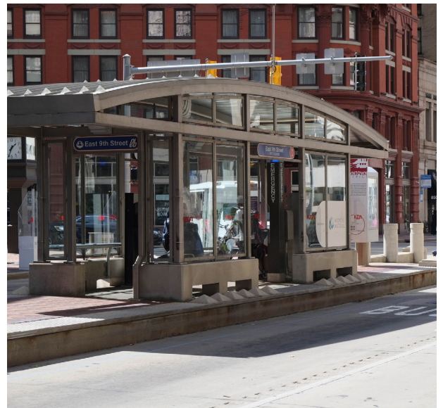
Health Line BRT, Cleveland, OH

The environmental analysis will follow state and federal processes and result in a document that explains why the project is needed, the alternatives that were considered, the project's impacts to the natural and built environments, and mitigation strategies for those impacts.