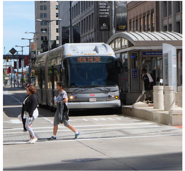
Health Line BRT, Cleveland, OH