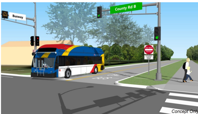
Rush Line BRT rendering (concept only)