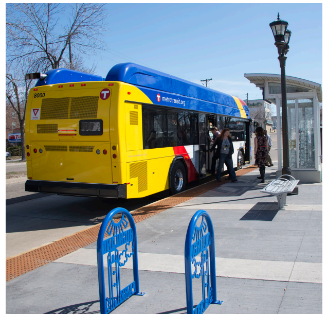
METRO A Line, Saint Paul, MN

The project is currently transitioning from Ramsey County to the Metropolitan Council, a transition that is expected to be complete by late 2021 or early 2022. As the region's leading transit provider, the Metropolitan Council has the experience and expertise to lead project development, final engineering and construction for the project. The project's transition to the Metropolitan Council includes renaming the project from Rush Line to METRO Purple Line.