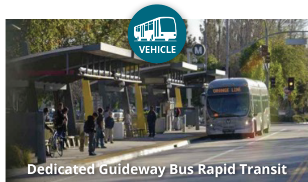
Orange Line BRT, Los Angeles, CA

The Rush Line locally preferred alternative is dedicated guideway bus rapid transit from Union Depot in St. Paul to White Bear Lake , generally along Robert Street, Phalen Boulevard, Ramsey County Regional Railroad Authority right-of-way (Bruce Vento Trail), and Highway 61.