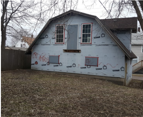
DETACHED 2-CAR GARAGE