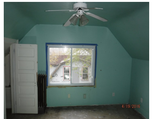
2ND FLOOR BEDROOM