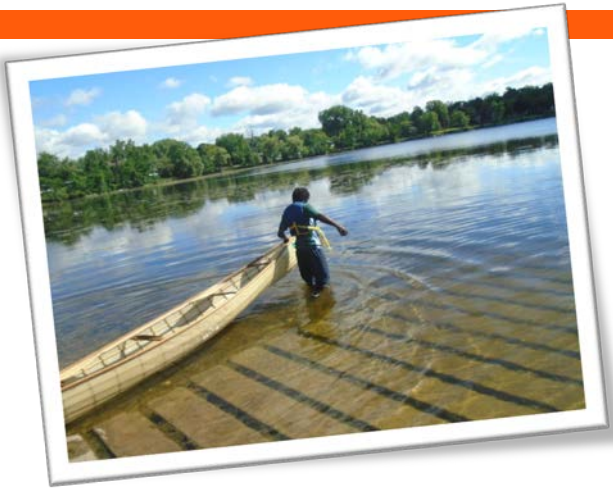
A resident wades into Lake Phalen with the one person canoe built at Boys Totem Town through the partnership with Urban Boatbuilders.