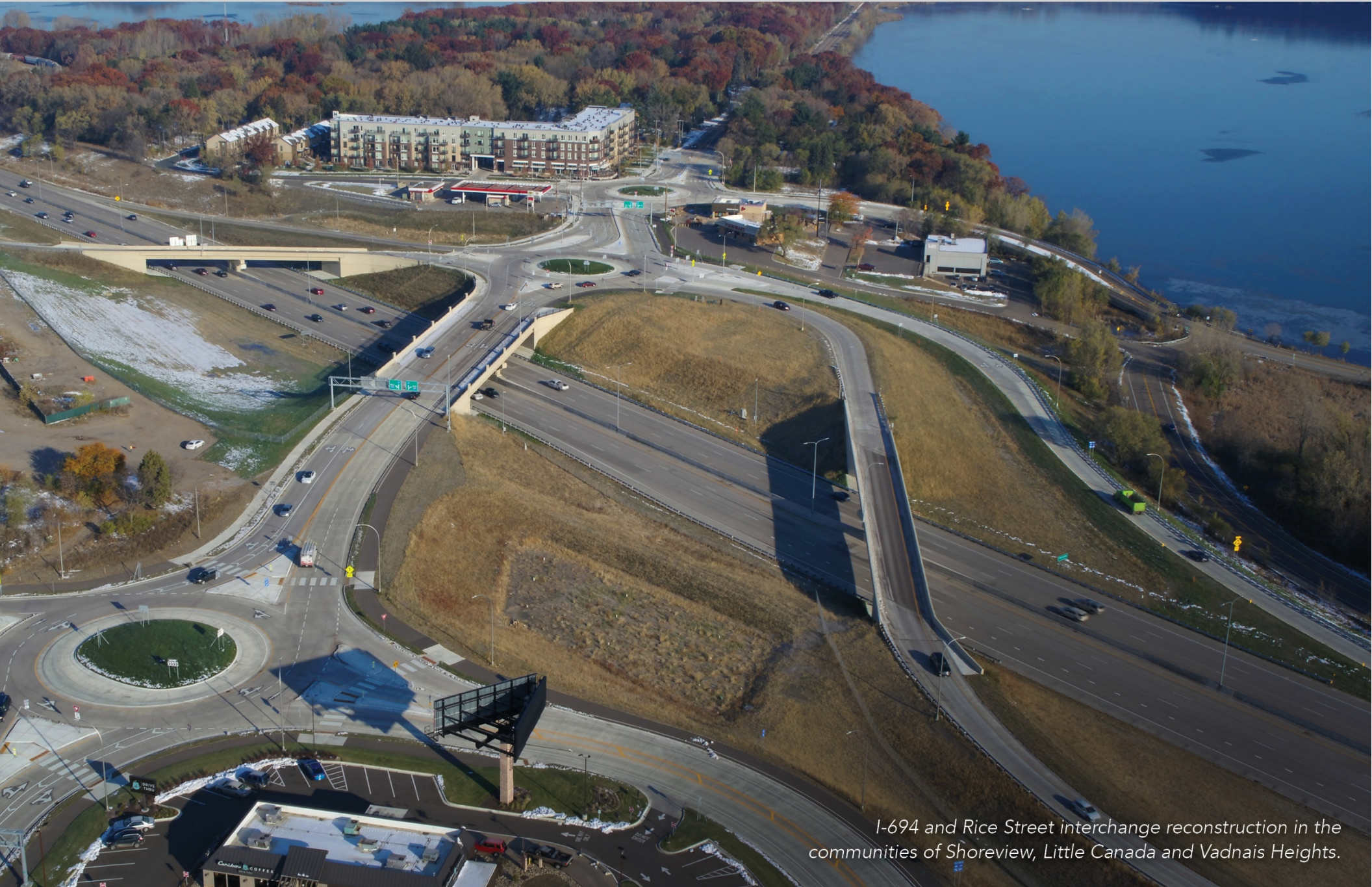
I-694 and Rice Street interchange reconstruction in the communities of Shoreview, Little Canada and Vadnais Heights.