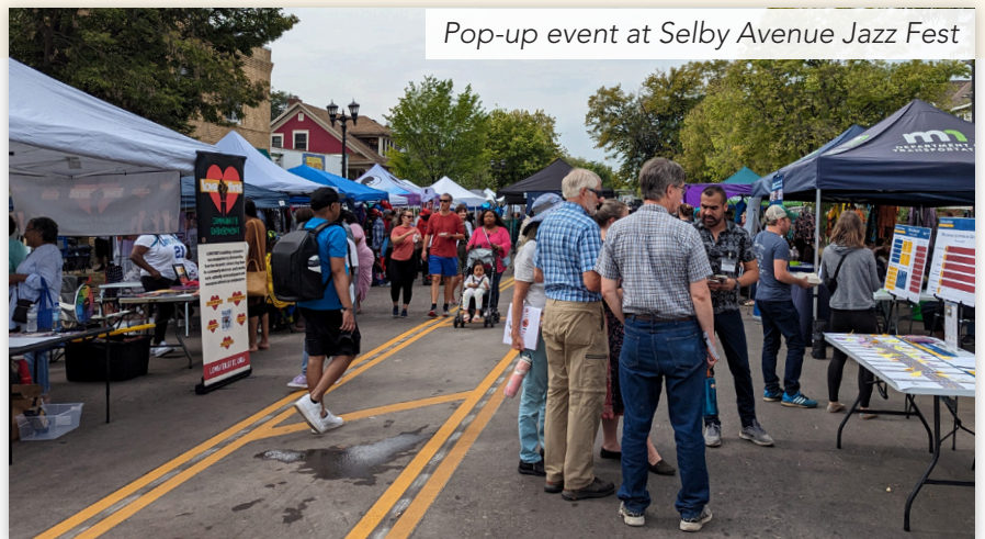
Pop-up event at Selby Avenue Jazz Fest