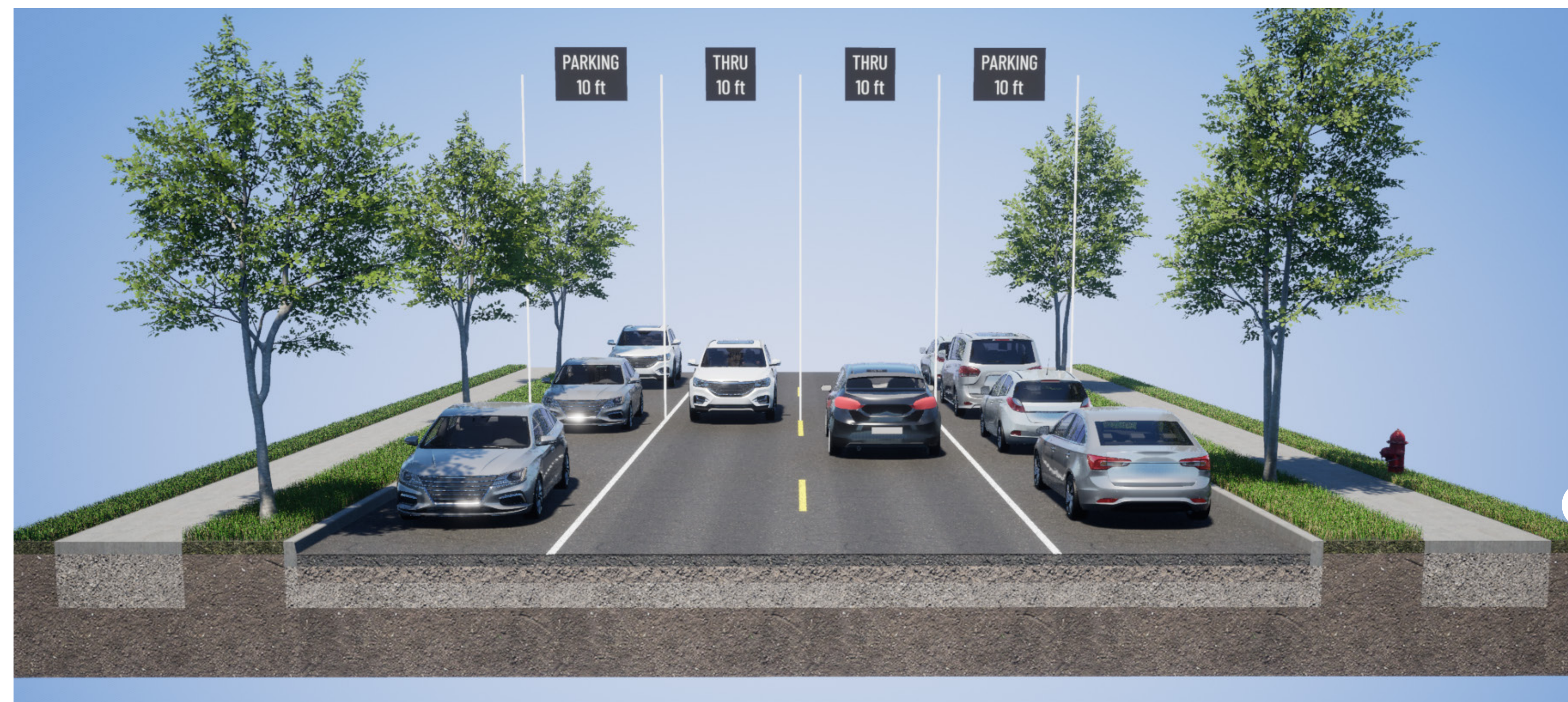
Summit Ave to Grand Ave