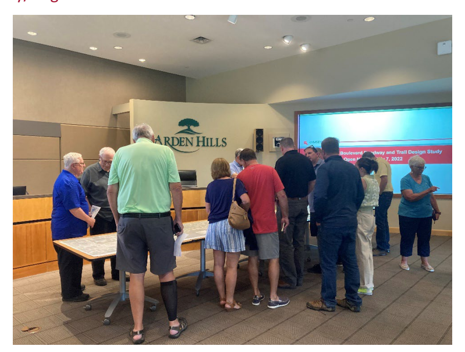
Figure 2.. Project staff review the trail designs with open house attendees.