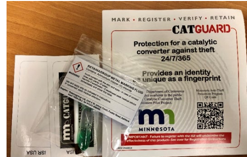
Photo of self-install marking kit

For Non-Residence in Ramsey County Contract Cities, please see download link for other partnering Cities: https://mn.gov/commerce-stat/xls/cc-participation-city.xlsx