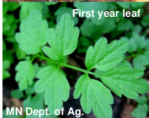
First year leaf