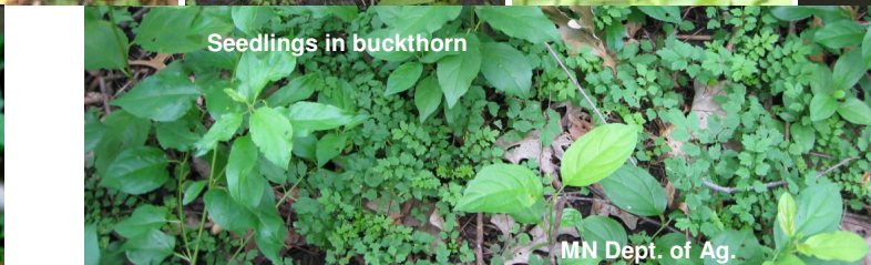
Seedlings in buckthorn